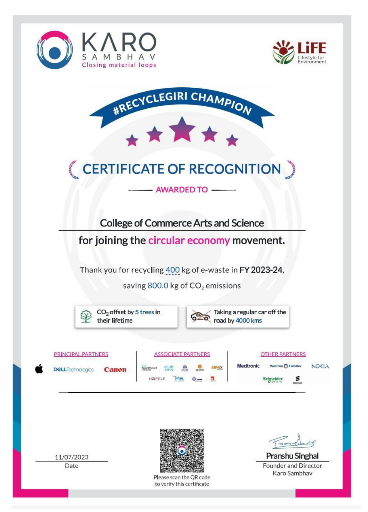
Fig.: Certificate by Karo Sambhav to the college.

Awareness Campaigns : various awareness campaigns, workshops, and events to educate and engage the college community in sustainable practices have been organized.