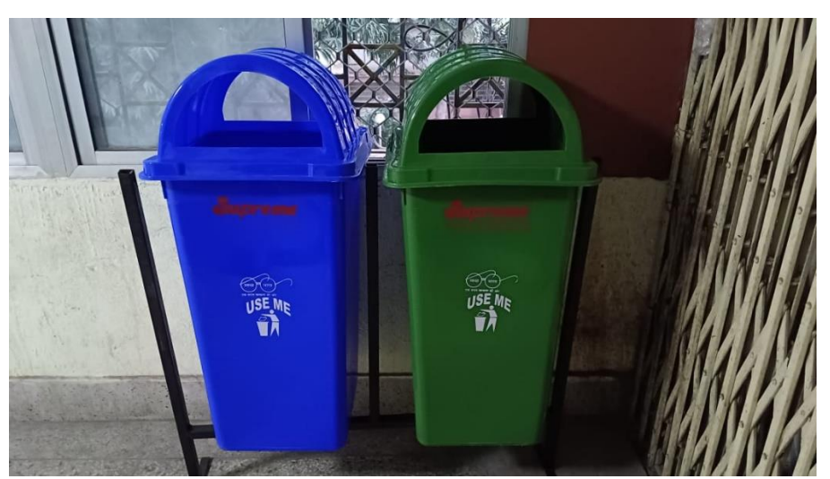
Fig.: Placement of separate dustbins for segregation of wastes.

Solid Waste Management: The college focuses on reducing waste generation and implementing the segregation of waste into bio-degradable and non bio-degradable wastes by the use of placement of green and blue dustbins in the college campus. The use of paper is minimized through digitization of attendance and assessment records.