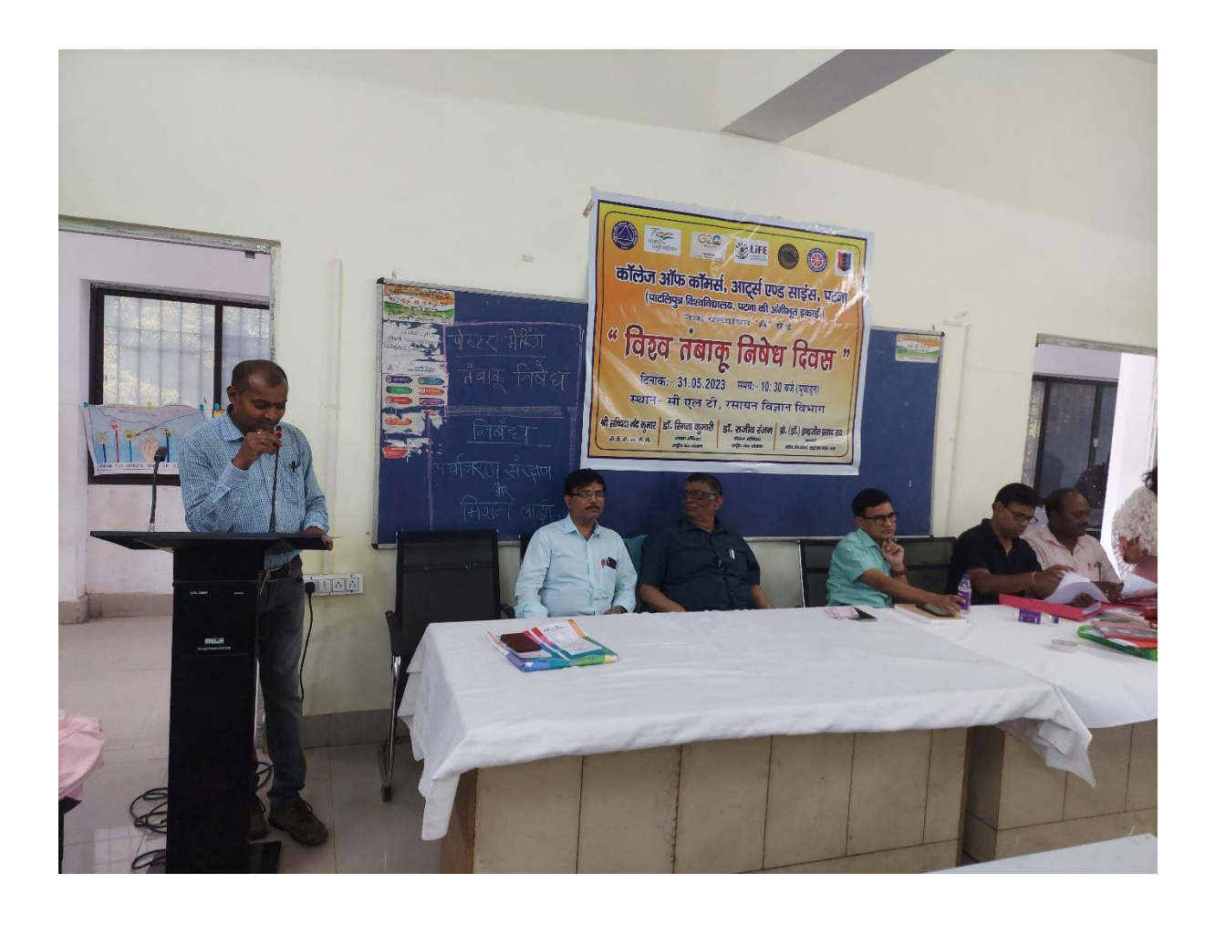
Fig.: Awareness Programme on NO TOBACCO DAY in the college campus.