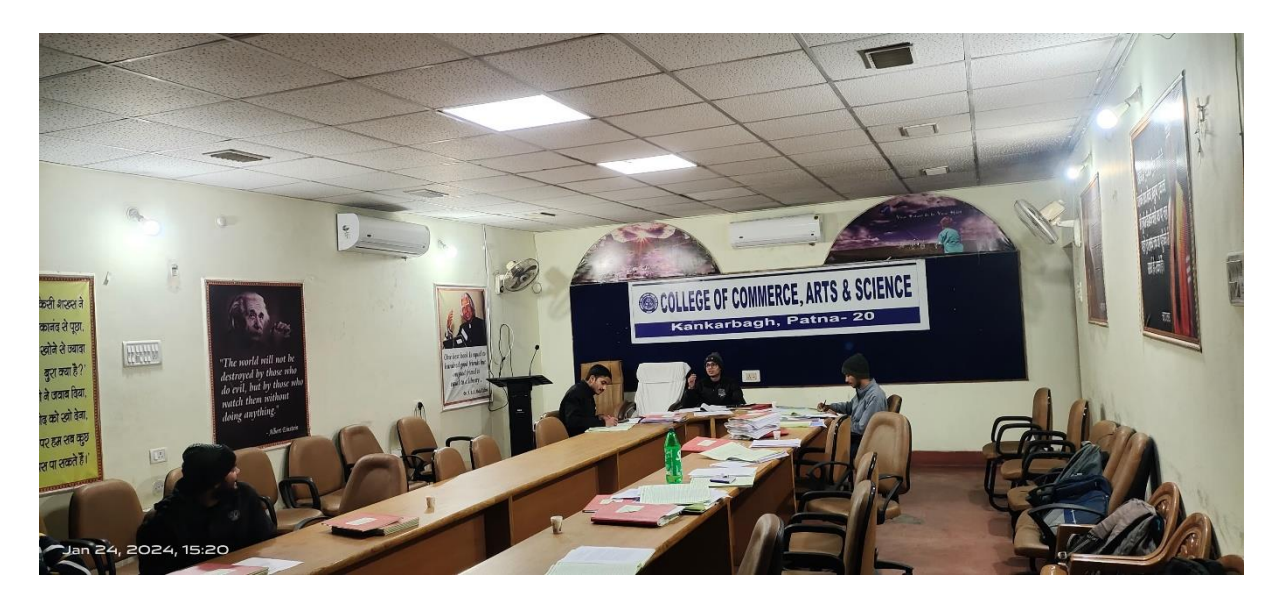
Fig.: Installation of LED lights for energy efficiency