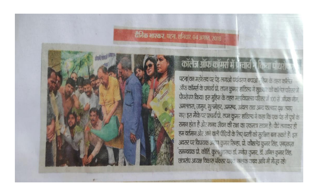
Fig.: Newspaper clipping of plantation drive in the campus.

vii) Plantation drives : The college organizes annual plantation drives to decrease carbon footprint and enhance the college ambience.