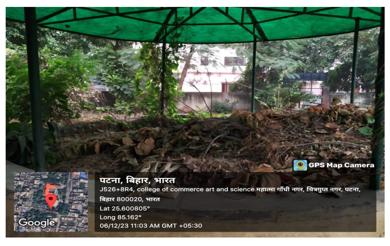
Fig.: Vermicompost in Botany department.