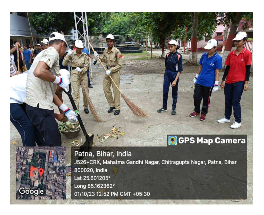
Fig.: Cleanliness drive by the students in the college campus.