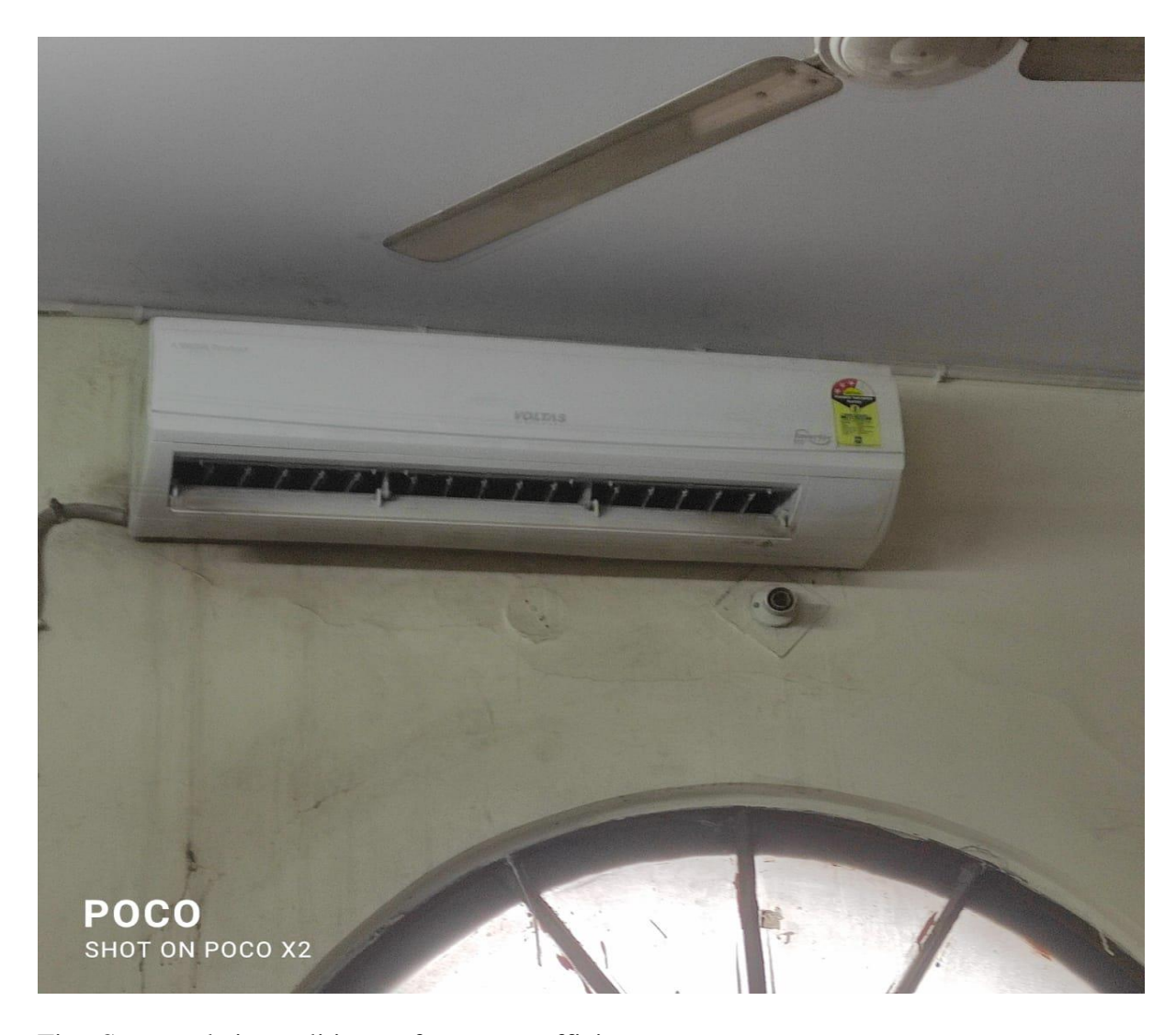
Fig.: Star rated air conditioners for energy efficiency