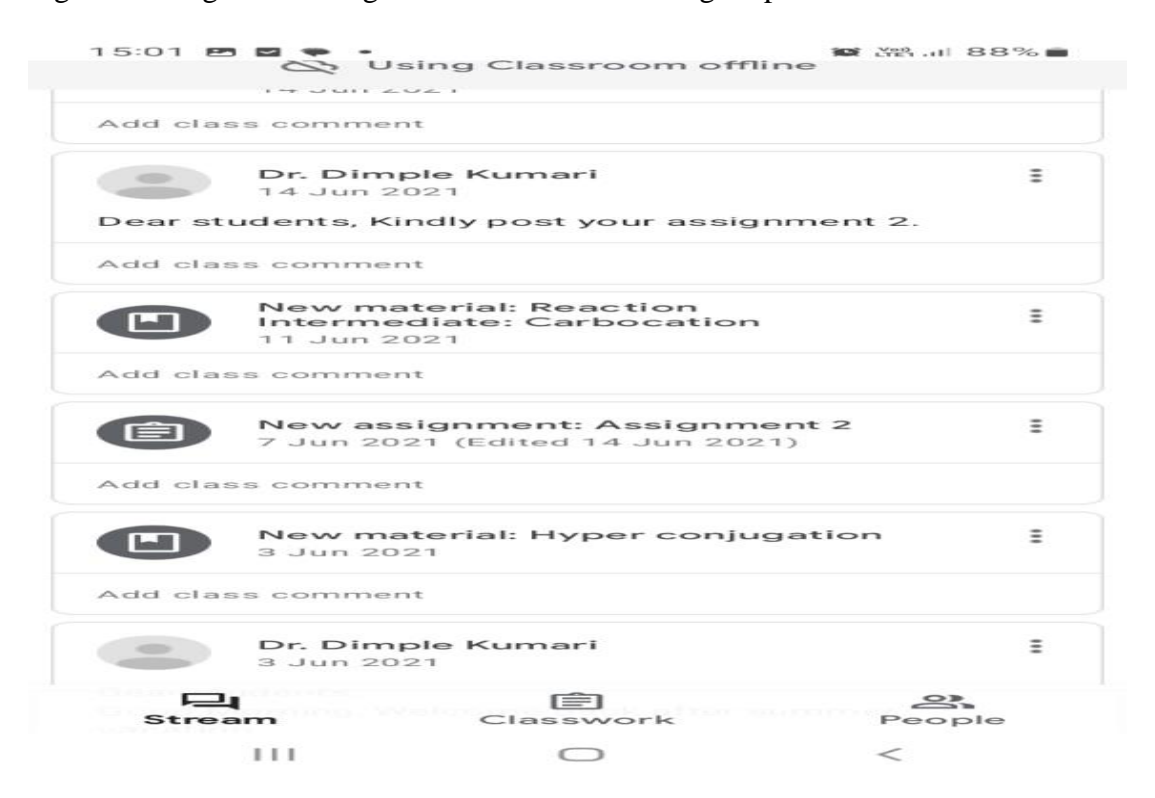
Fig.: E-assignment on Google classroom.