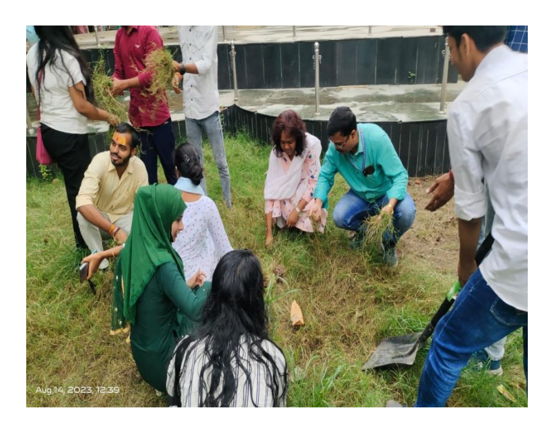
Fig.: Cleanliness drive by the students in the college campus.