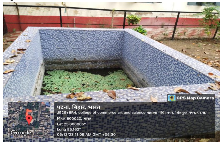
Fig.: Rainwater Harvesting unit installed near Zoology department.

i) Rainwater Harvesting: Rainwater harvesting systems have been installed in all campus buildings. This collected rainwater has been used for various purposes, including irrigation, flushing toilets, and ground water replenishment.