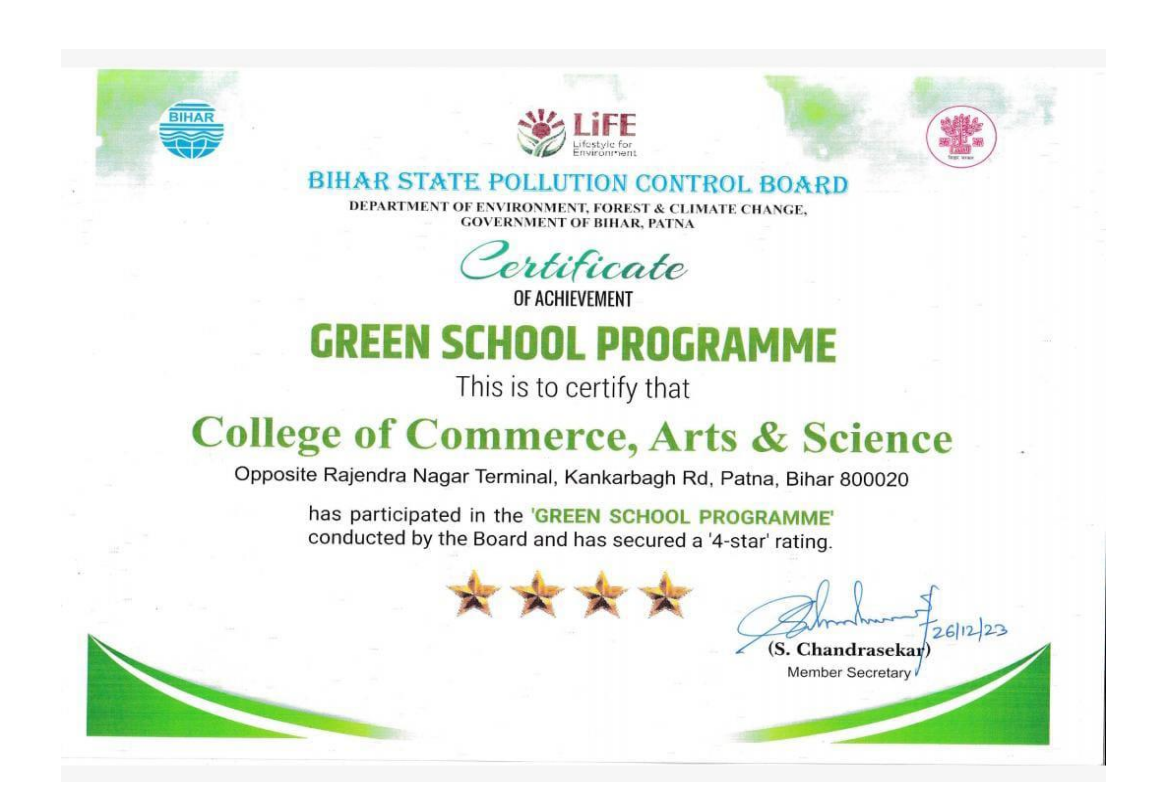
Fig.: Certificate by the Bihar State Pollution Control Board (BSPB) to the college.

vi) Clean Air Initiatives: The college encourages the use of public or college transportation to reduce air pollution and limits the entry of private vehicles within the campus. Smoking and the use of tobacco products are strictly prohibited to maintain a smoke-free campus.