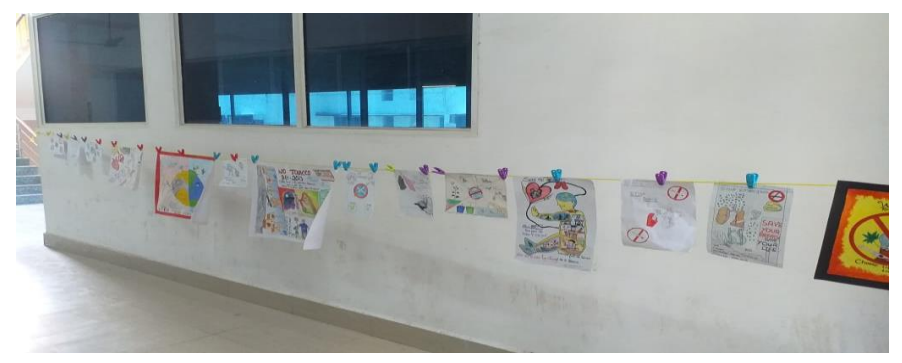
Fig: Poster session on NO TOBACCO DAY

Paperless Operating Procedure- Digital communication, and e-assignments are encouraged in the curriculum.