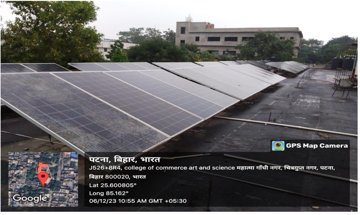
Fig.:Solar Panels installed in the campus

3.Renewable Energy Installation : Solar panels have been installed in the campus for clean energy generation.